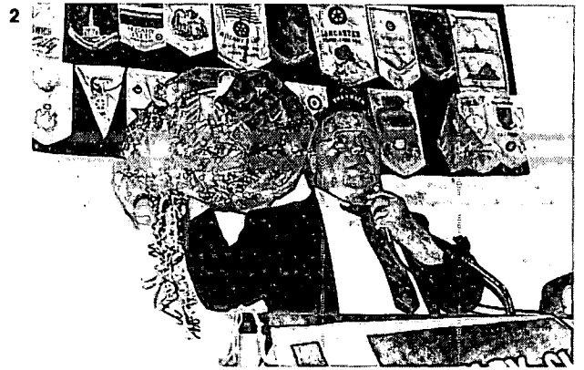
GUESS WHAT IT IS & YOU CAN BID ON IT