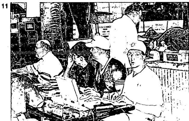
AFTER YOU BID...PAY HERE