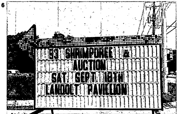
HERE WE ARE