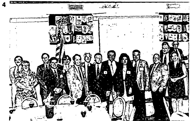
NEW RECRUITS = EXTRA HANDS