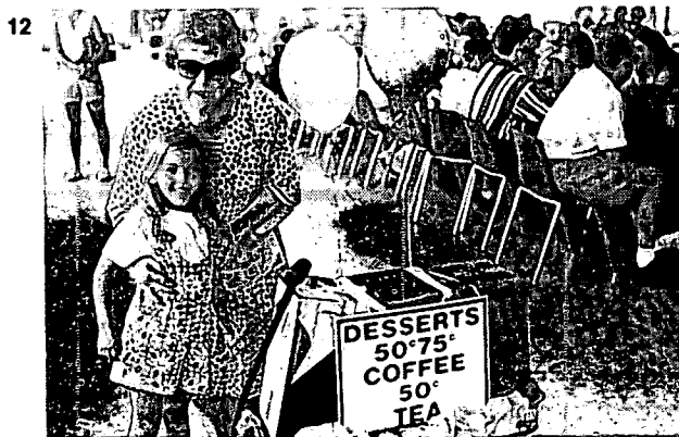
A YOUNG ENTREPRENEUR