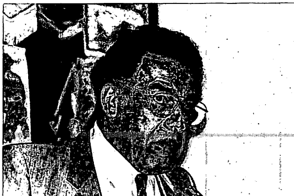
YOU WILL HAVE FUN !