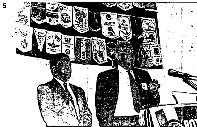
A FATHER & SON AFFAIR