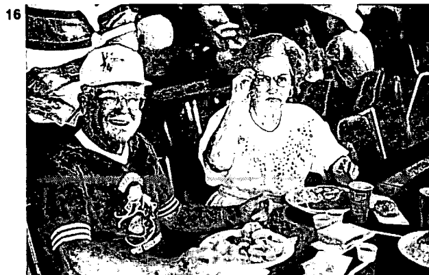
LOOKS GOOD ENOUGH TO EAT