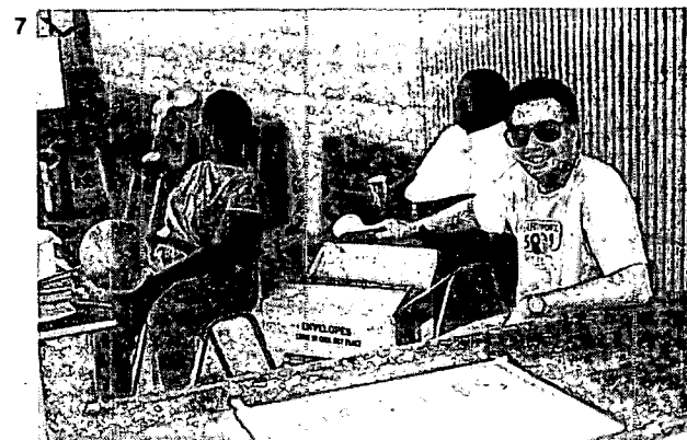
TICKET BOOTH IS READY