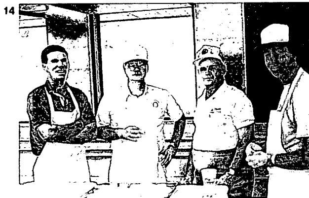
MORE HAPPY CAMPERS